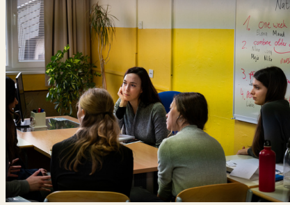
Committee 4 working with their expert