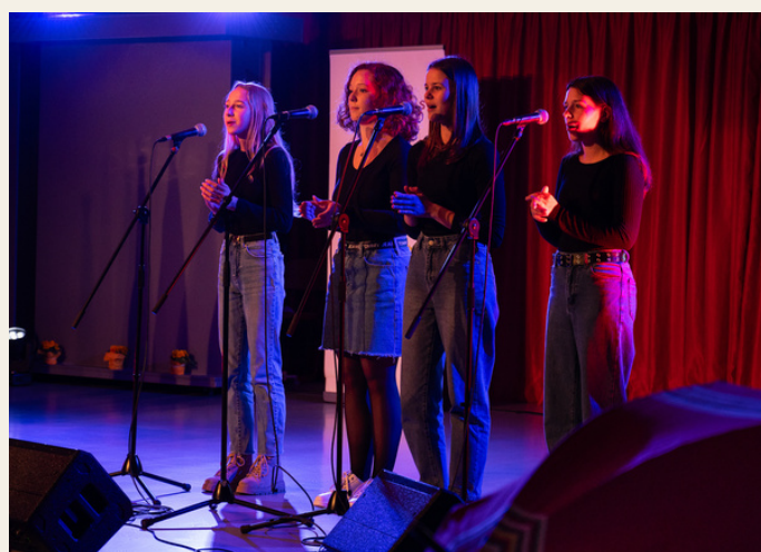
Students singing traditional slovenian songs

After all the delegations were presented, accompanied by a traditional Slovenian dance of two teachers, the long awaited dinner came. Accompanied by beautiful piano music, the delegates and guests joined together and enjoyed their dinner.