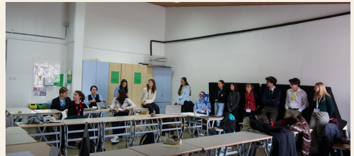
Committee 1 at work

The postulation highlights the risk posed by fragmented protection of natural areas, which threatens local biodiversity. To address this, the postulation suggests establishing ecological corridors to connect habitats and safeguard entire ecosystems. Collaboration with private landowners is proposed to identify areas requiring heightened protection. Ecological corridors play an important role in preserving biodiversity by enabling natural movement between protected areas. It emphasizes the importance of local authorities enforcing regulations and educating stakeholders to mitigate potential industrial encroachment, stressing the need for comprehensive protection efforts supported by collaboration with NGOs.