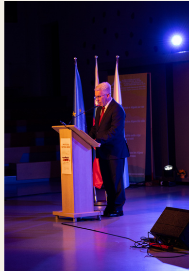
Headmaster of the school

The first speaker of the evening was the school's headmaster, who expressed his gratitude and wished us a successful YPAC week.