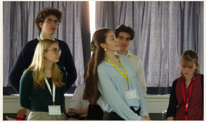
Committee 1 delegates