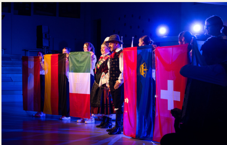
All the flags of the YPAC delegations