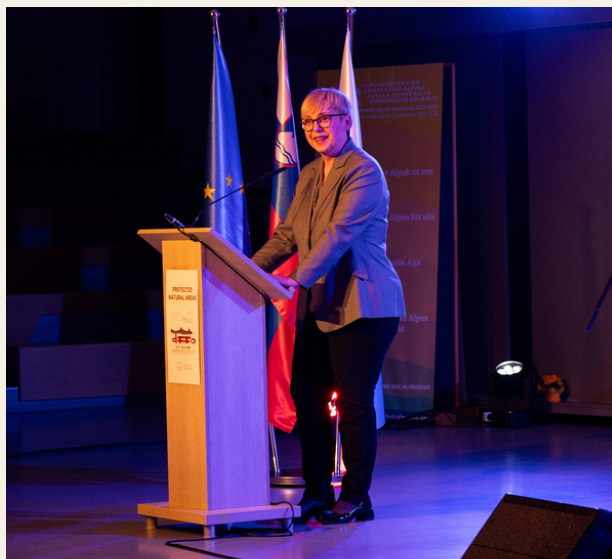
President Nataša Pirc Musar

After the headmaster it was the president's turn to make a speech. Nataša Pirc Musar thanked all of us for our continuous hard work and our hopes to make the Alpine region a better place to live. She promised to support the YPAC in the years to come and wished us a pleasant stay in Kamnik, her hometown.