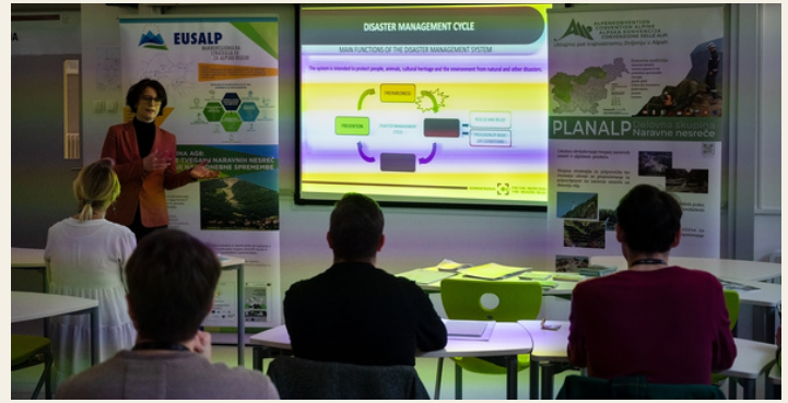
EUSALP YC at work