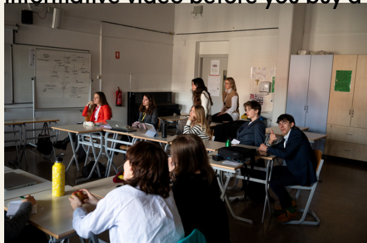
committees at work

The committee wants to create a ticket system. Before entering a protected area, you must buy a ticket at the visitor center, which would be called the "green ticket". With the ticket, you can control the number of tourists that come into the area so there are less crowded areas and nature wouldn't be harmed so badly. New jobs for locals could also be created. They also want to include an informative video before you buy a ticket.