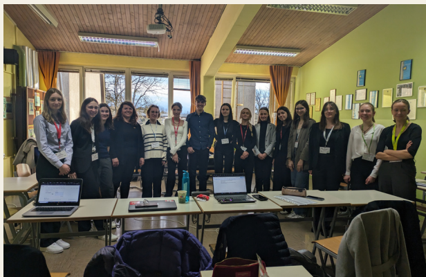
committee 3 with their expert

The idea is to organise a yearly school trip in a sustainable way, including protected natural areas. The aim is to raise awareness towards children and influence them into pursuing sustainable tourism in their future.